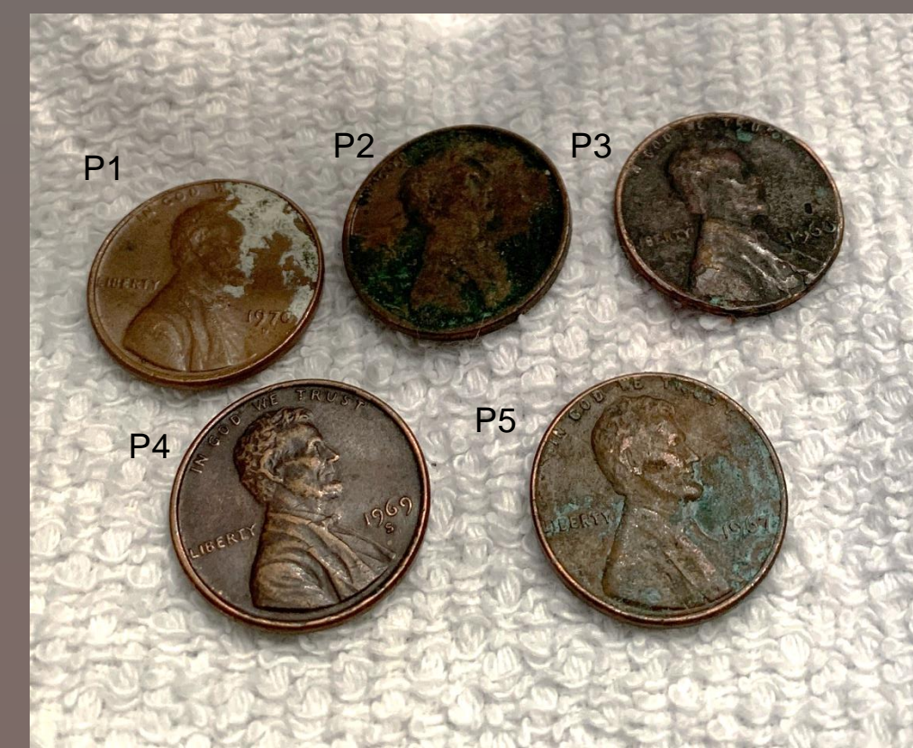
Tap Water Before