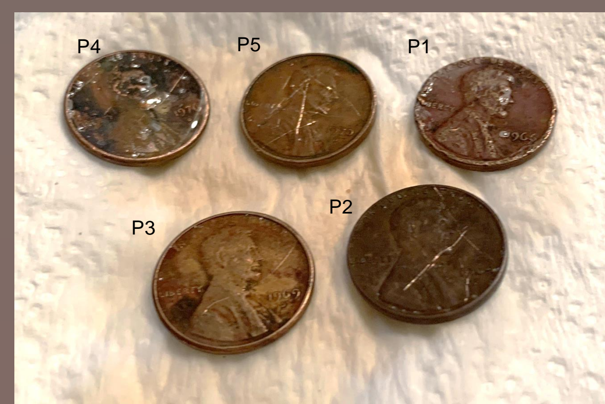
A&W Root Beer After