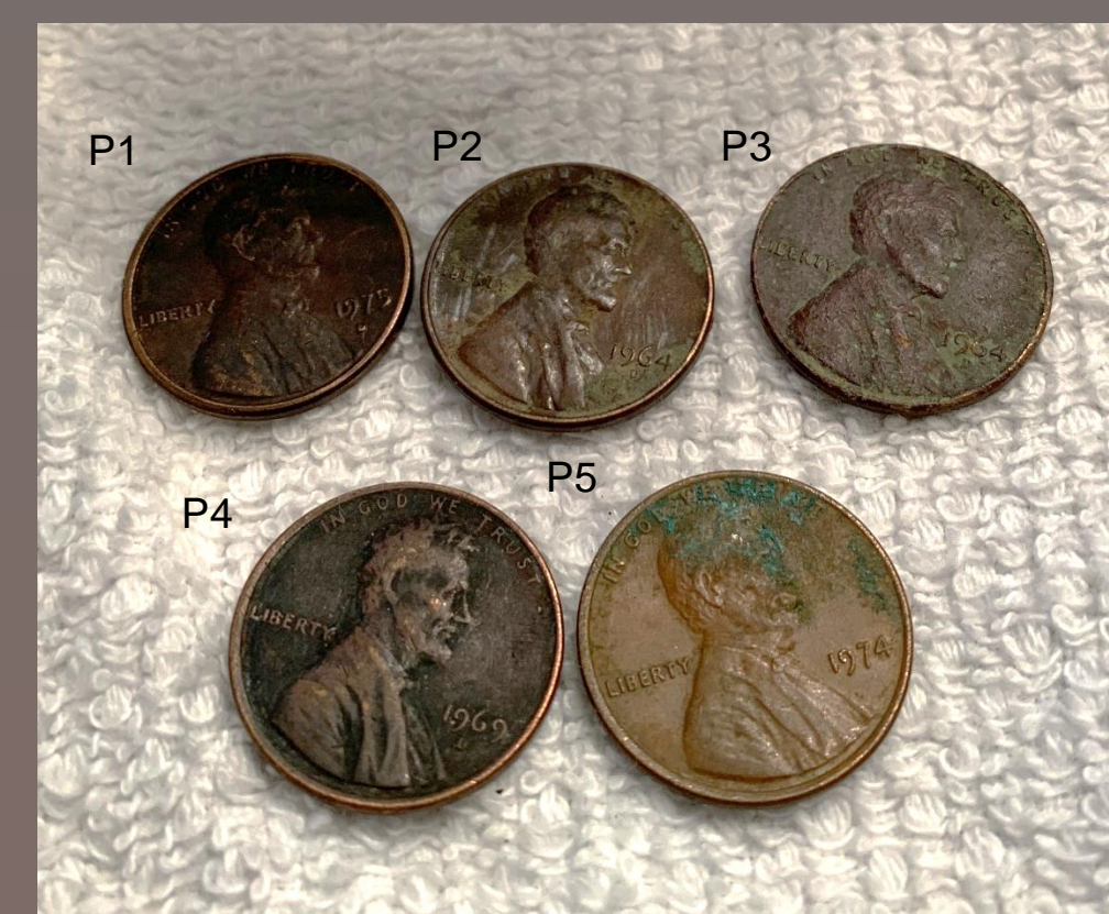
Dawn Dish Soap Before