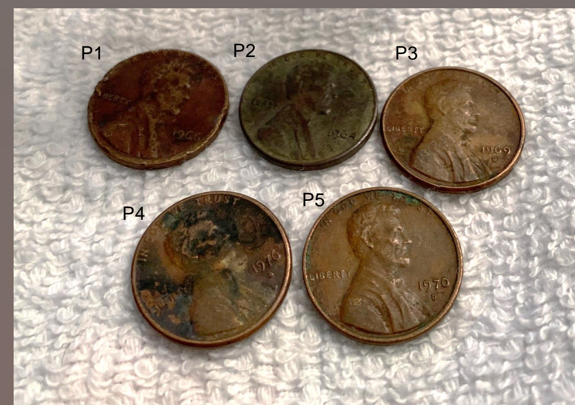
A&W Root Beer Before