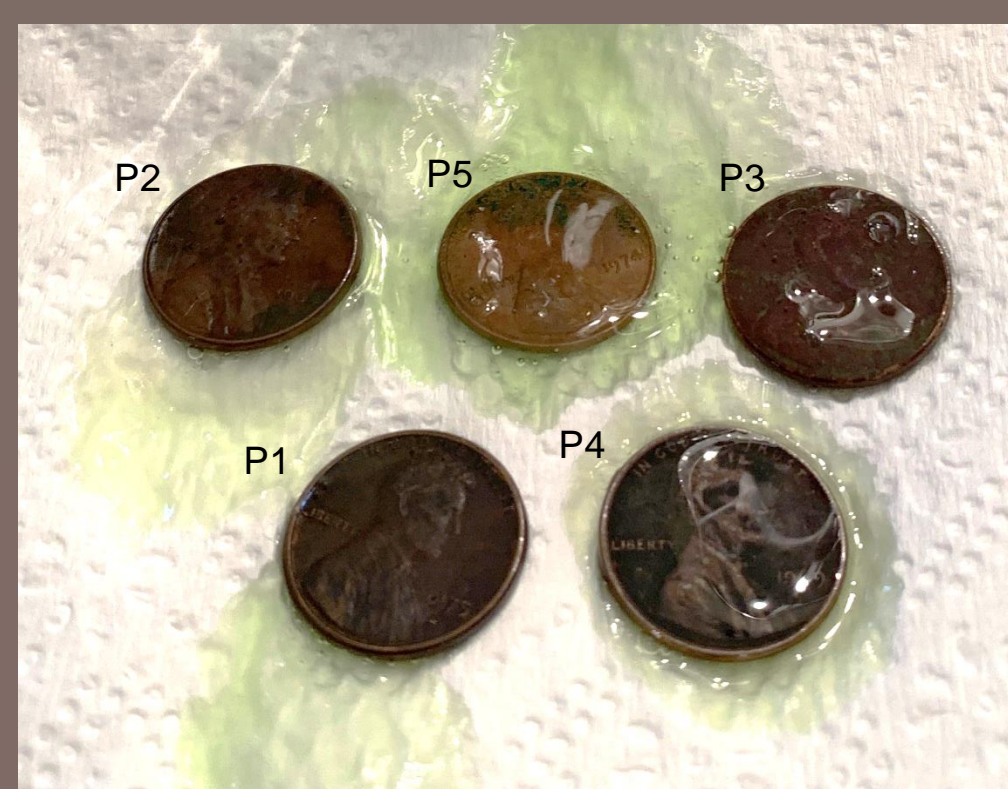
Dawn Dish Soap After