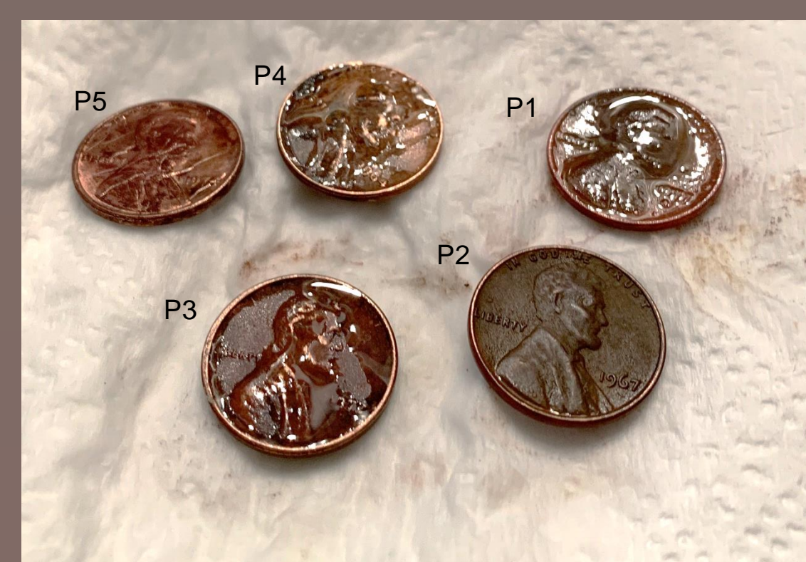
Distilled White Vinegar After