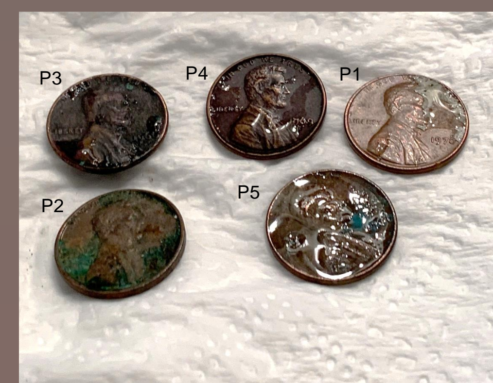
Tap Water After