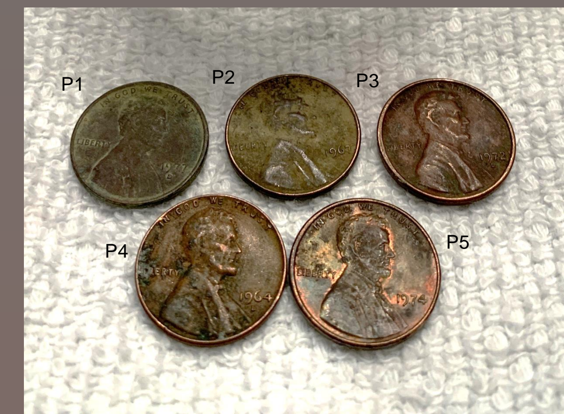
Distilled White Vinegar Before